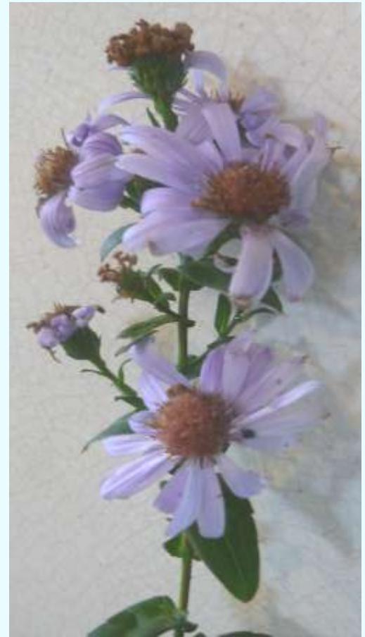
Submitted by: Ali Dyche