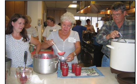
Trainees practice what they learn in a hands-on workshop.