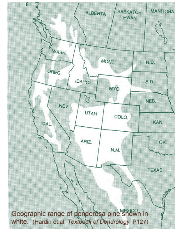
Geographic range of ponderosa pine shown in white. (Hardin et.al. Textbook of Dendrology , P127)

Ponderosa pine is the most widely distributed species of pine in the United States.