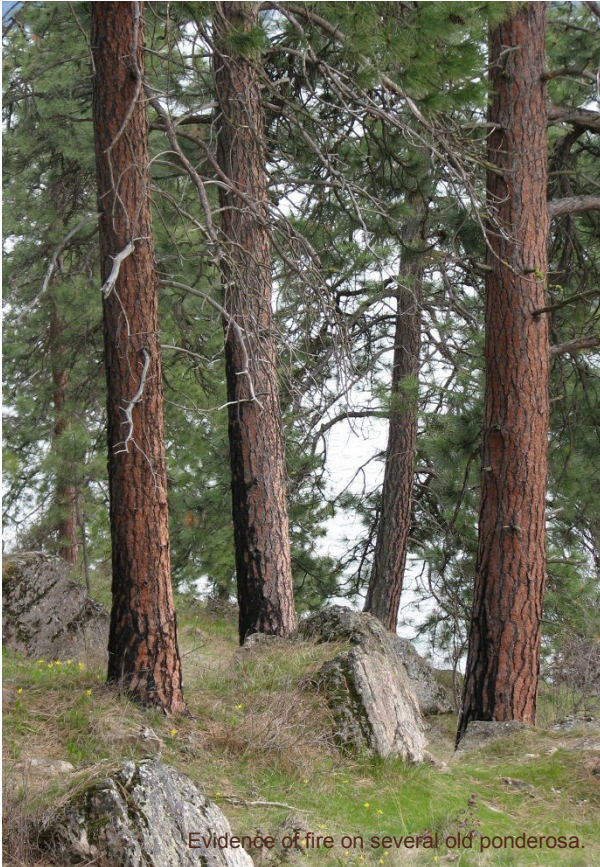
Evidence of fire on several old ponderosa.

Whether you have ponderosa pine on your property or just want to know more about it, this will be a great opportunity to get outside and interact with experts and other landowners.